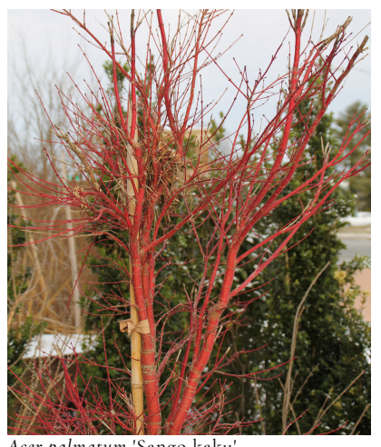
Acer palmatum 'Sango kaku

Every day is a new learning curve regarding the state of the pandemic. As we tire of wearing masks indoors, our outdoor Garden continues to be a place of peace, hope and respite. Currently, there is no admission fee, but donations are always welcome which allows our Garden to grow. If you visit often, consider becoming a member. Your membership can cover registration fees for most classes and discounts in the garden shop or plant sales as well as perks when visiting 300+ member garden through the American Horticultural Society's reciprocal program.